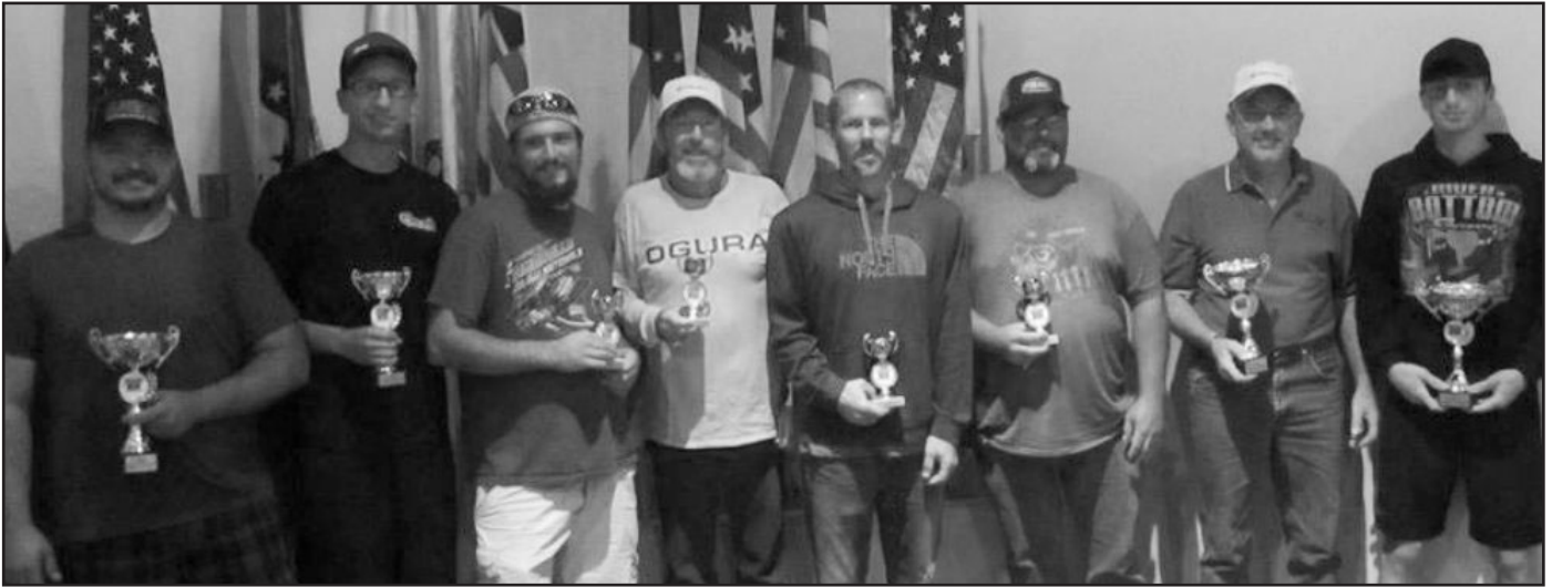
"B" Prepared Winners