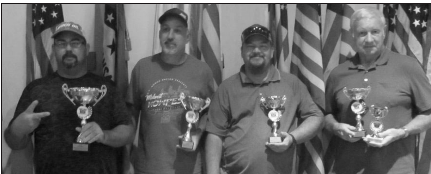
"C" Prepared Winners