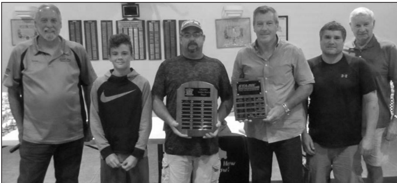
The 2018 Golden Blade Winners - NASGRASS (Formerly Florida Lawnracing Association)