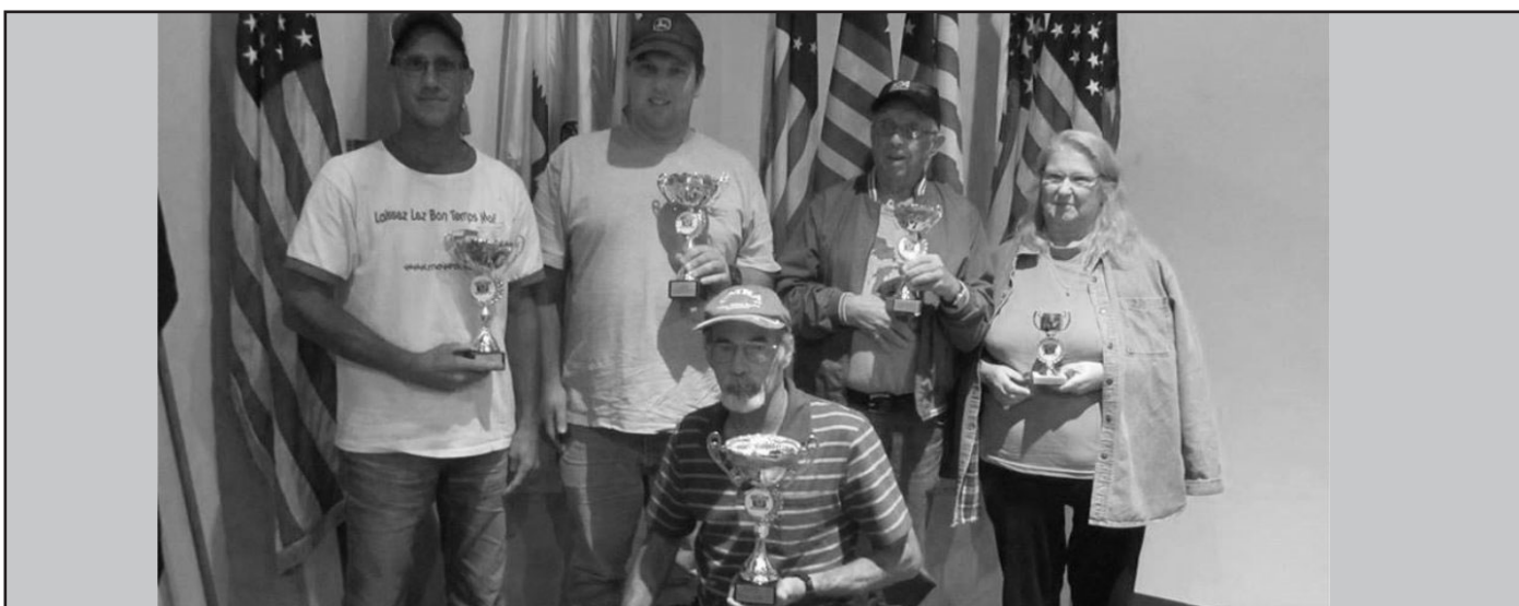
International Mower of Weeds (IMOW) Winners