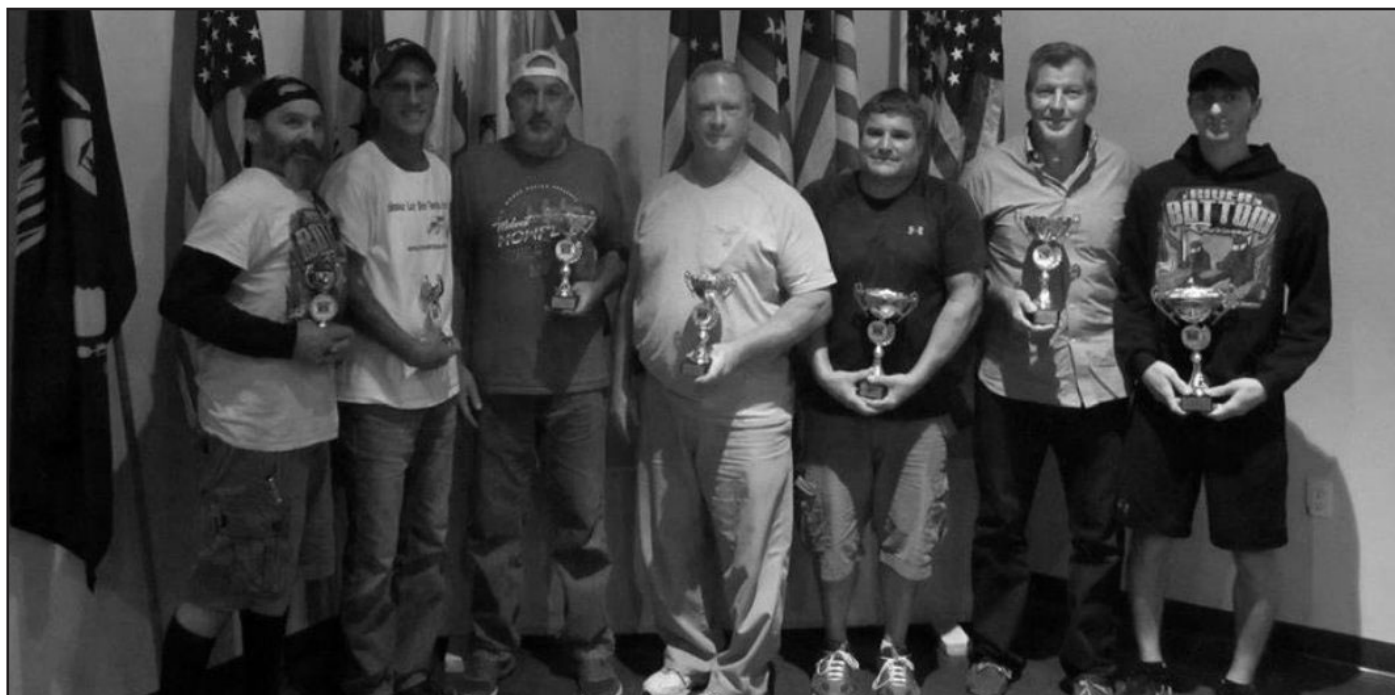
Governed Prepared Winners