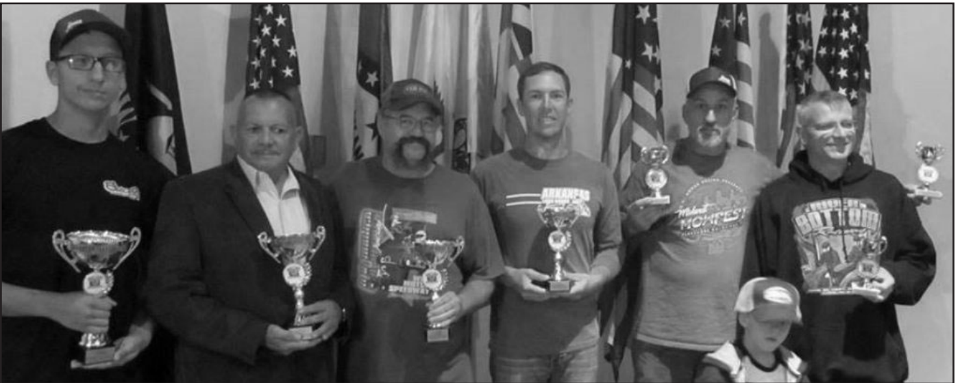
Factory Experimental Single Winners