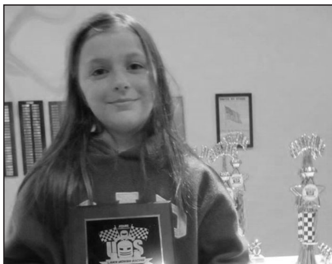
Rookie of the Year (Junior Prepared)