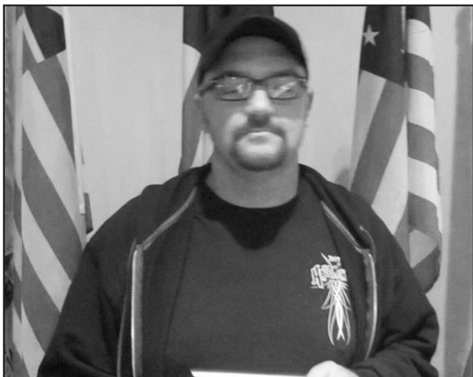
Rookie of the Year (Adult)