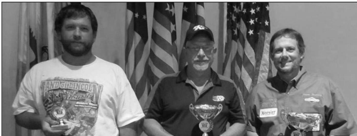
"A" Prepared Winners