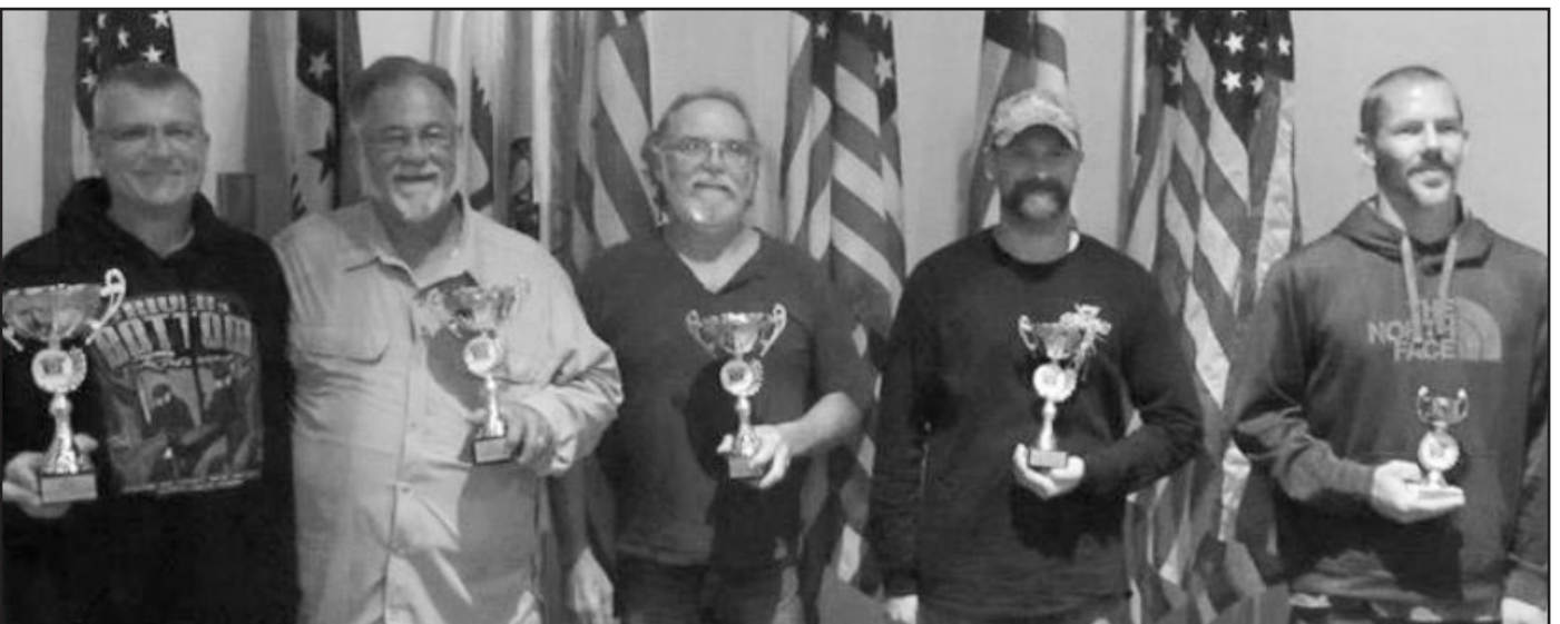
Factory Experimental Twins Winners