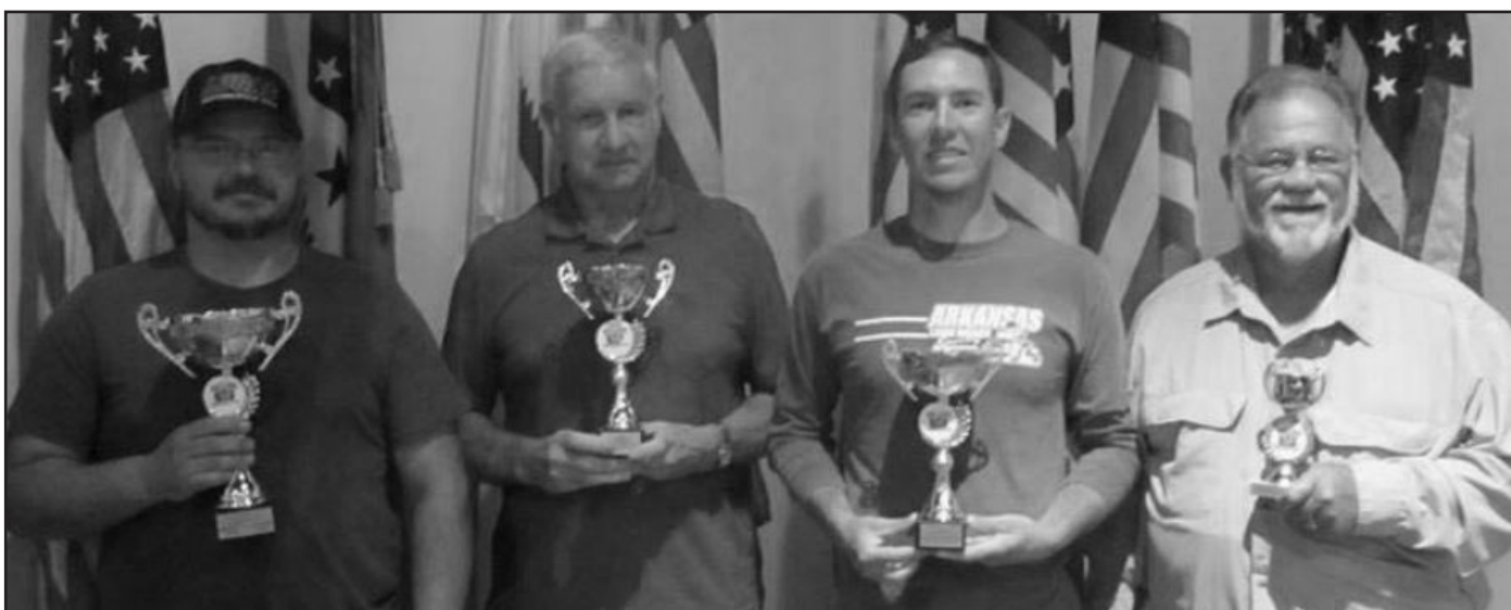
Single Prepared Winners