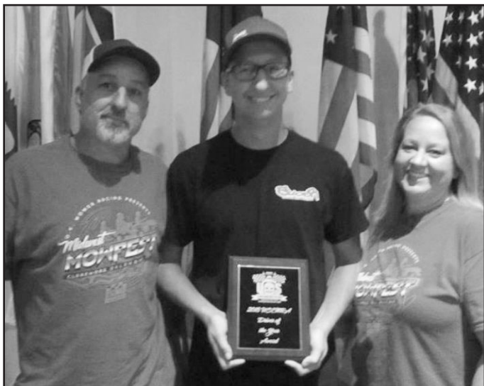
Driver of the Year