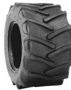
Firestone Flotation 23