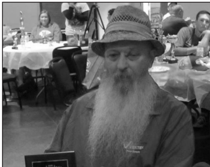
Most Improved Driver