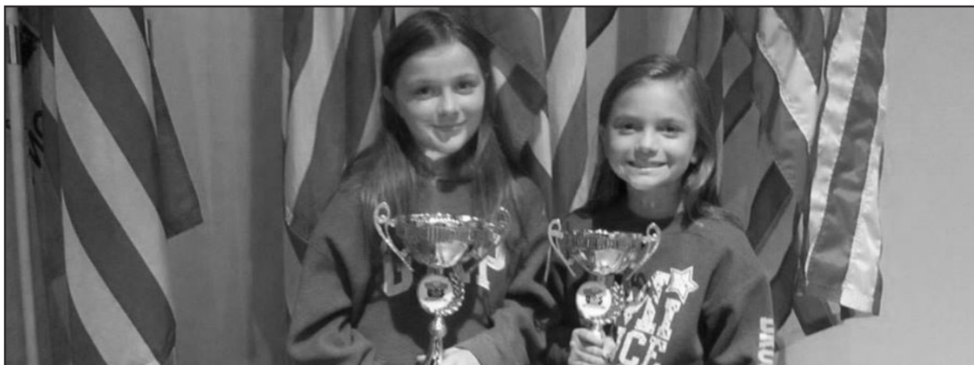
Junior Prepared Winners