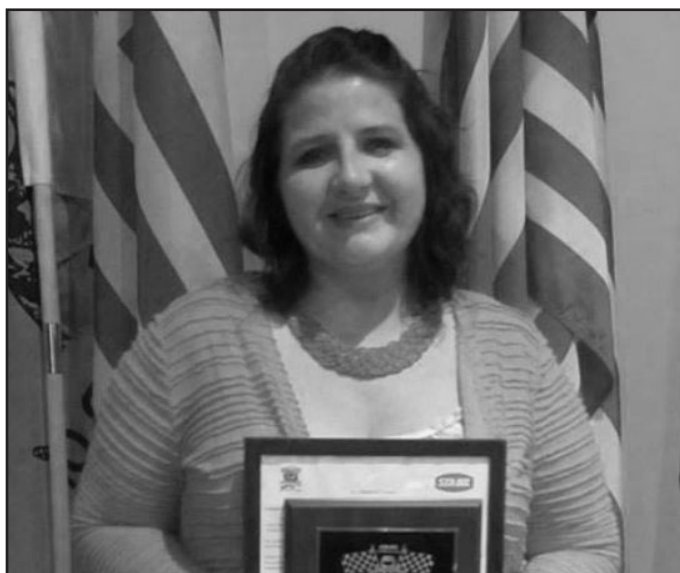
The Dubba G. Everyman Award