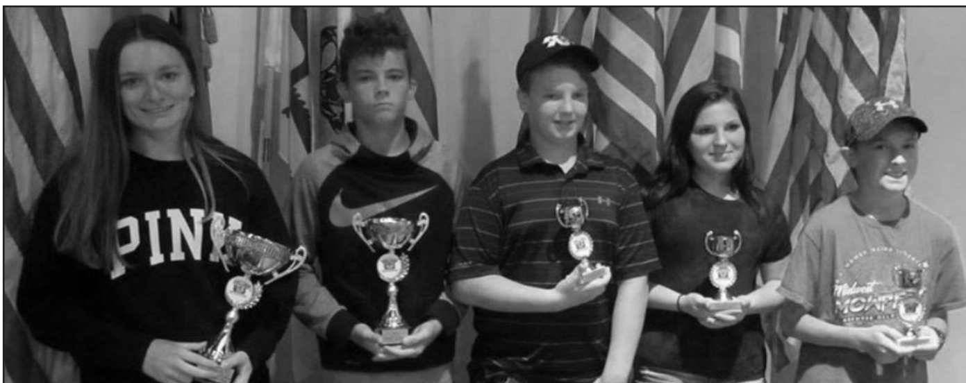
Governed Prepared Kids Winners