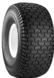
Carlisle Turf Saver