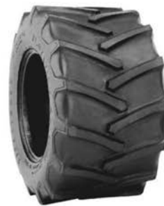
Firestone Flotation 23