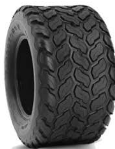
Firestone Turf & Field