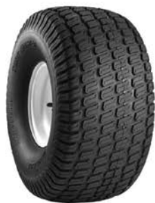
Carlisle Turf Master